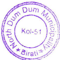
Chairman North Dum Dum Municipality Chairman North Dum Dum Municipality

Detailed information may be available from the Water Works Department & Daily News paper.