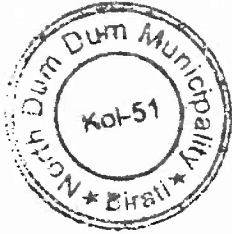
Chairman North Dum Dum Municipality