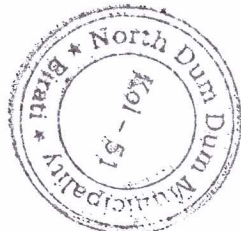
Chairman North Dum Dum Municipality Chairman North Dum Dum Municipality